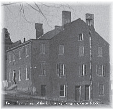
circa 1865.

With time, the school relocated and the building was purchased by the Masons. During the Civil War, the Union Army used the building for a hospital during the battle of Fredericksburg.